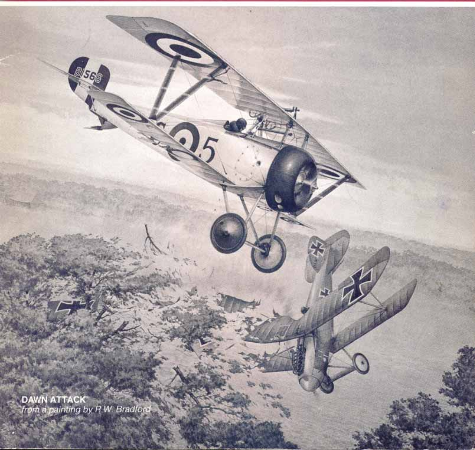
DAWN ATTACK from a painting by R.W. Bradford