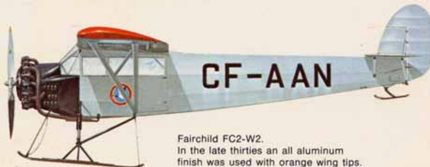
Fairchild FC2-W2. In the late thirties an all aluminum finish was used with orange wing tips.