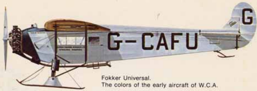
Fokker Universal. The colors of the early aircraft of W.C.A.