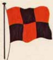
Canadian Airways Insignia Eastern Lines