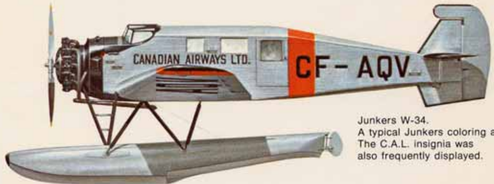
Junkers W-34. A typical Junkers coloring and lettering. The C.A.L. insignia was also frequently displayed.