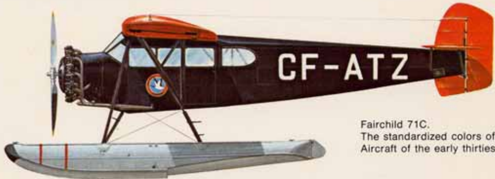
Fairchild 71C. The standardized colors of C.A.L. Aircraft of the early thirties.