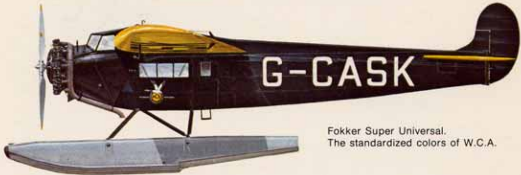
Fokker Super Universal. The standardized colors of W.C.A.