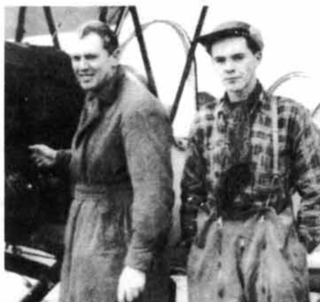
29 'Buzz' Beurling: Barnstormer