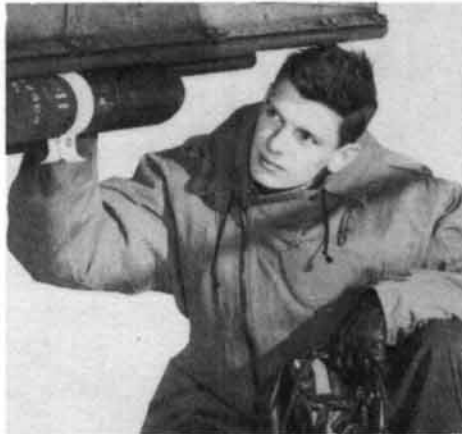
4 An Armourer's Life