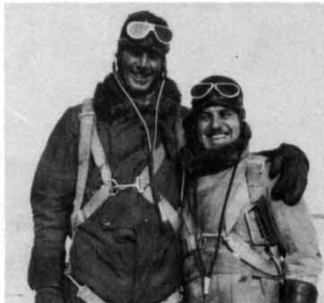
12 Military Aviation in the 30s