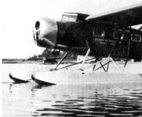
15 On the Step with EDO