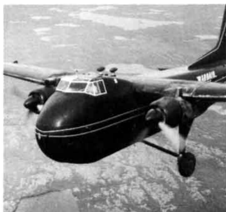
28 Bristol's Rugged Freighter