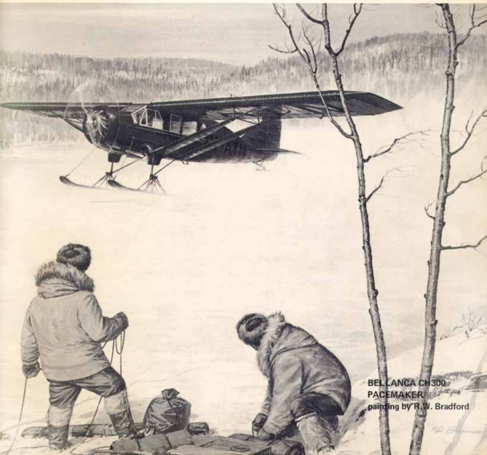
BELLANCA CH300 PACEMAKER painting by R.W. Bradford

published by the CANADIAN AVIATION HISTORICAL SOCIETY VOL. 13 NO. 1 SPRING 75