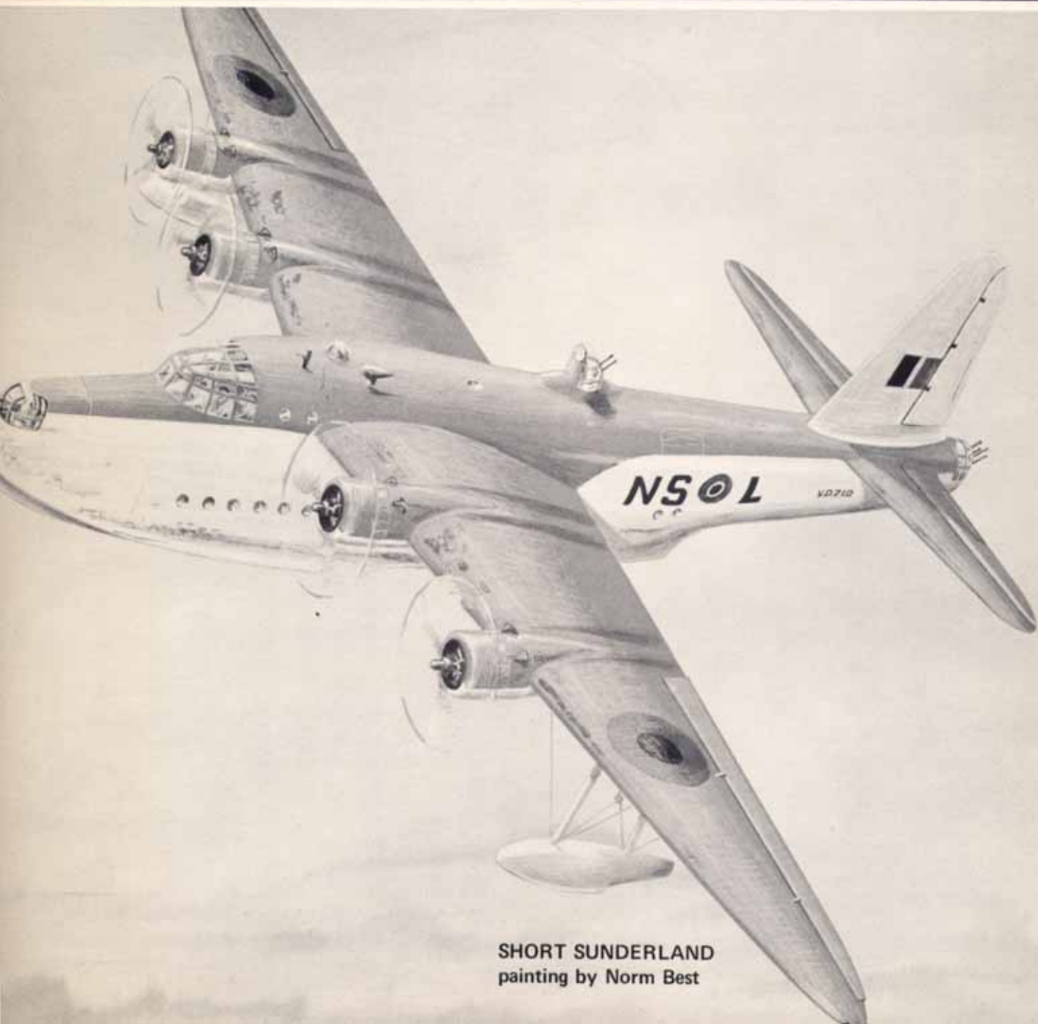
SHORT SUNDERLAND painting by Norm Best