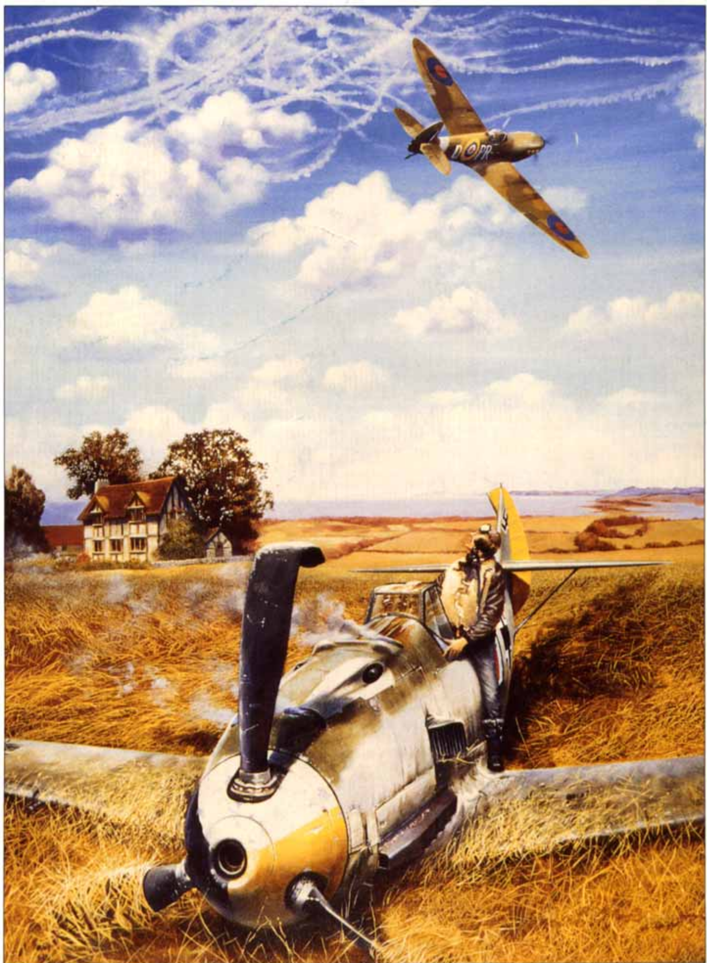
Messerschmitt Bf 109E: Forced Landing on the Isle of Wight painted by Bob Curry