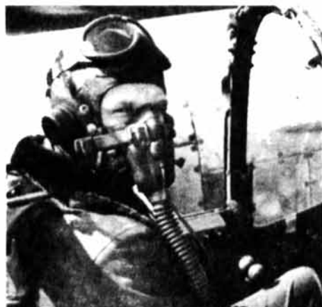
76 P-38 Civil Operations

Digital Typesetting & Assembly: Alan Williams Design • Printed by Barker Cambria Press, Toronto