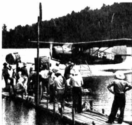
88 Hollywood in the Bush