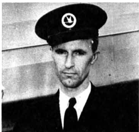
98 Icing over the Rockies